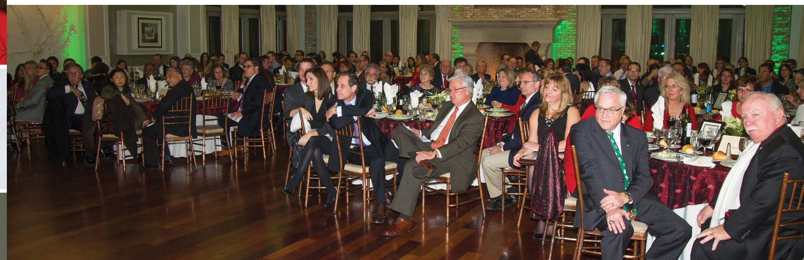
D&B's 2014 Holiday Celebration